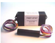
FAST-STAT T-STAT WIRE MULTIPLEXER